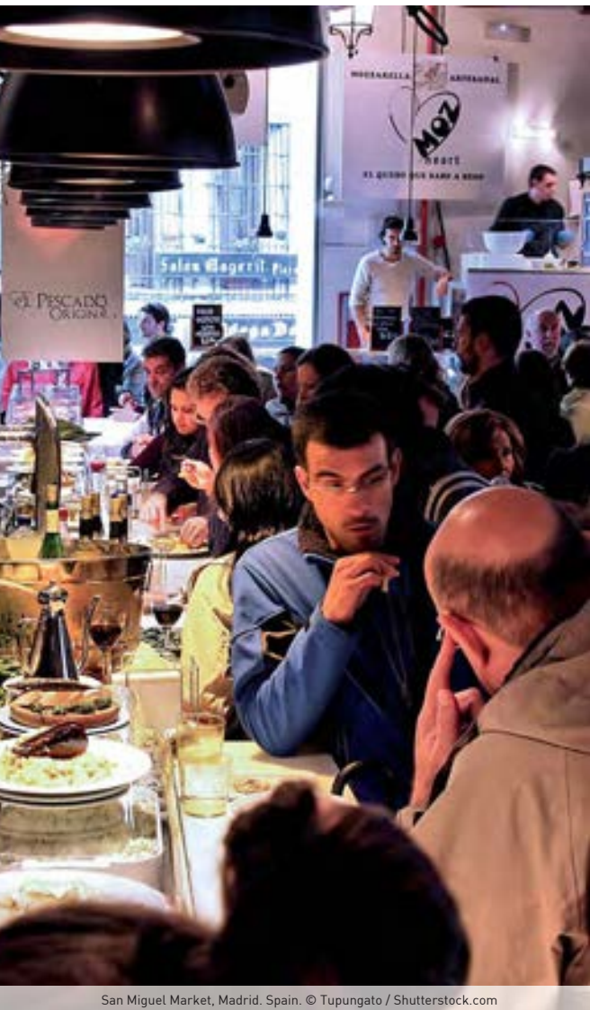
San Miguel Market, Madrid. Spain.

and econometrics are making a mistake by looking exclusively at bank lending because it is non-bank lending that is growing. That is why I talk about bonds and direct financing, which already amount to EUR 85 billion (8.5% of GDP). International banks are supporting Spanish companies, bank lending is stabilising and non-bank financing is starting to shoot up, all of which leads to the conclusion that 2014 will be the first year in which finance will enable GDP growth. However, finance is different from what it used to be. Companies are issuing bonds and an Alternative Fixed-Income Market has been set up to help them do that. Nonetheless, there is still a question mark over small businesses. The solution is to provide SME loans to open up securitisation markets, but it must be implemented at the