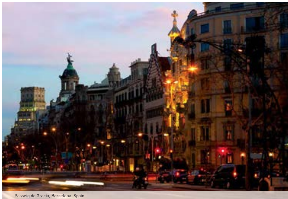
Passeig de Gracia, Barcelona. Spain

and econometrics are making a mistake by looking exclusively at bank lending because it is non-bank lending that is growing. That is why I talk about bonds and direct financing, which already amount to EUR 85 billion (8.5% of GDP). International banks are supporting Spanish companies, bank lending is stabilising and non-bank financing is starting to shoot up, all of which leads to the conclusion that 2014 will be the first year in which finance will enable GDP growth. However, finance is different from what it used to be. Companies are issuing bonds and an Alternative Fixed-Income Market has been set up to help them do that. Nonetheless, there is still a question mark over small businesses. The solution is to provide SME loans to open up securitisation markets, but it must be implemented at the