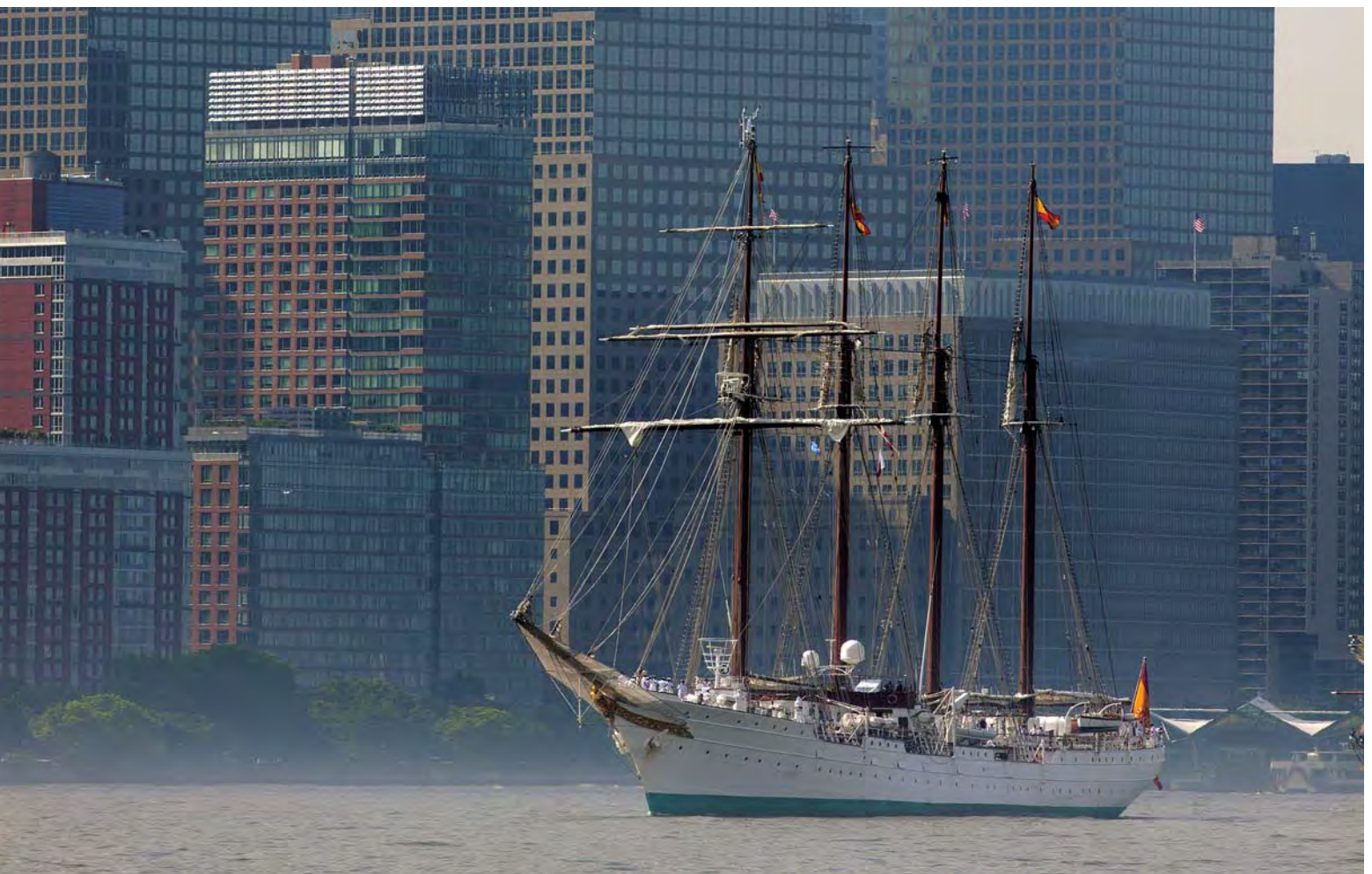
The training ship Juan Sebastian de Elcano entering the river Hudson in 2012. Honorary Ambassador for Marca España in 2009. Since 1927, it has completed 84 education and research cruises around the world

opinion leaders, i.e. journalists and other prominent professionals from selected countries, and encouraging the government's participation in programmes connected with governance, institutional cooperation and technical training; highlighting our national security forces' participation in international peacekeeping missions; stepping up civil society involvement in communication and promotion campaigns for Marca España; and focusing particularly on major events.