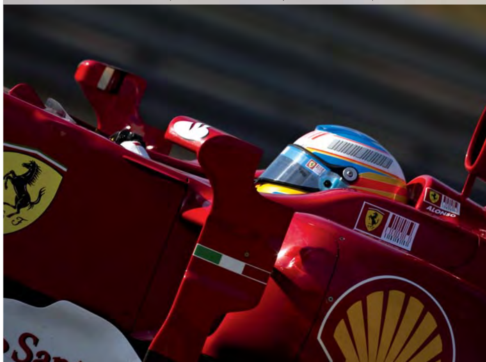
Fernando Alonso, Formula One World Champion in 2005 and 2006 and Honorary Ambassador for Marca España in 2013

Marca España aims to help Spain get back on track to growth and job creation. Improving our country’s image both here and abroad