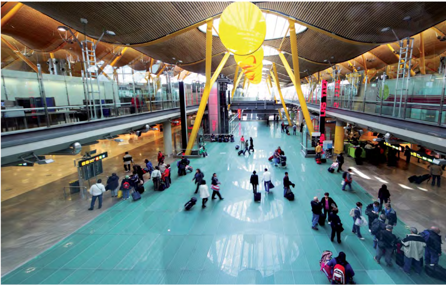
International terminal T4 at Barajas airport, an architectural avant-garde . Madrid. Spain

Marca España's objective for 2020 is to cement an image of Spain as an economic and political power, a country that is traditional and at the same time modern and innovative, robust and reliable, caring, diverse, flexible and open to change