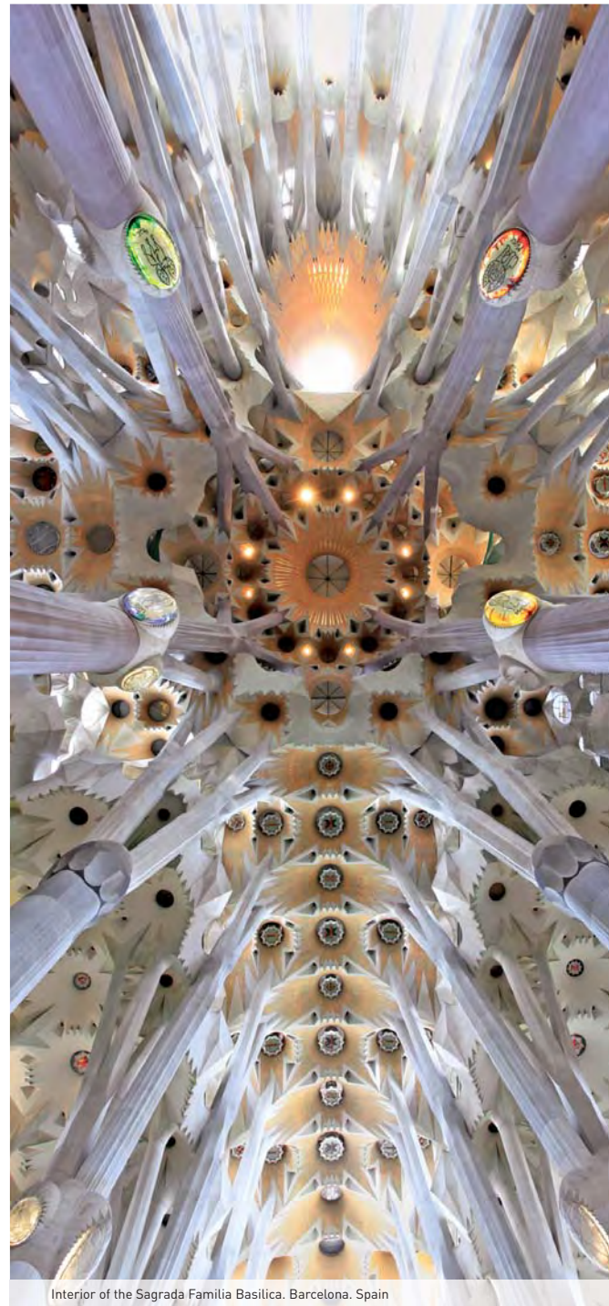
Interior of the Sagrada Família Basilica. Barcelona. Spain

All our peers (EU and G20 countries) have been pursuing similar policies for years. We are closely observing the programmes and best practices these countries are following with a view to using them for Marca España.