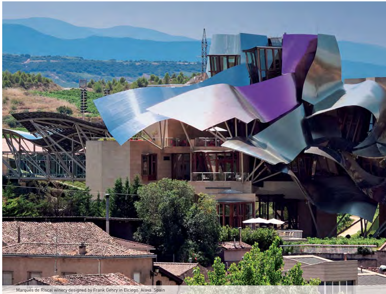
Marqués de Riscal winery designed by Frank Gehry in Elciego, Alava, Spain

Marca España's primary mission is to uphold and strengthen its inspiring principles and values within Spain. We will hardly be able to stand up for them if we do not believe in what we are and what we have