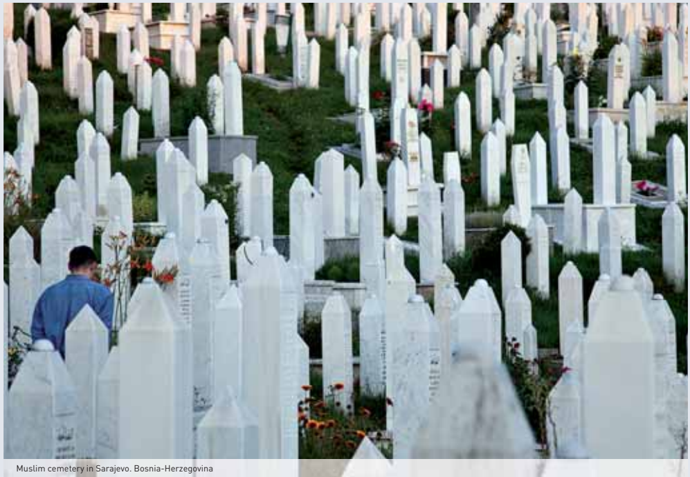
Muslim cemetery in Sarajevo, Bosnia-Herzegovina

There is nothing funny about death, but there are people who die with humour