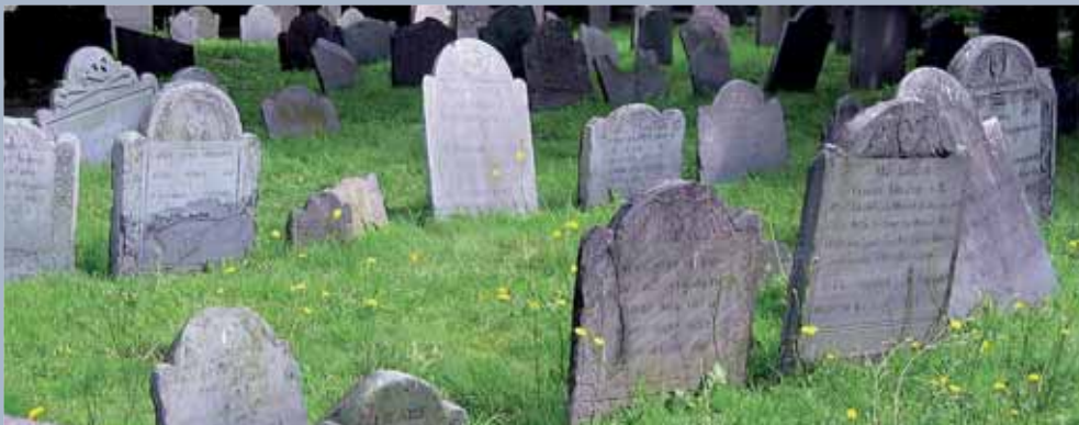
Boston cemetery, USA

Funeral directors and burial insurance get lumped together and today they are still seen as stagnant sectors