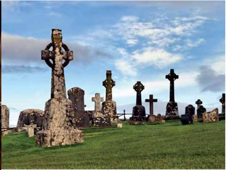
Celtic cemetery in Cashel, Ireland

and that these services provide guidance to families on how to put this process on the right track.”