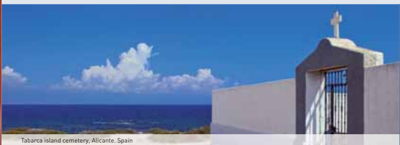
Tabarca island cemetery, Alicante, Spain