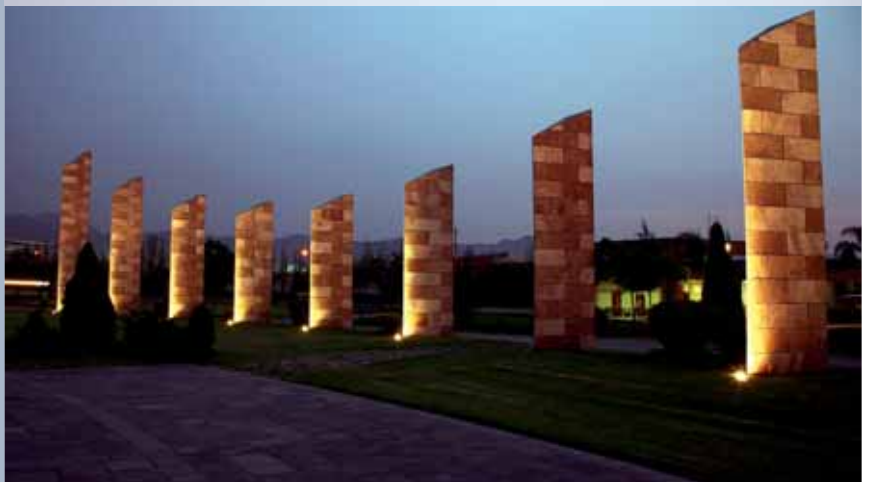
Huachipa cemetery, Peru

be considered, for example if the death occurs somewhere other than the place of residence. These policies also include national and international assistance or to take care of everything, regardless where the death occurs.”