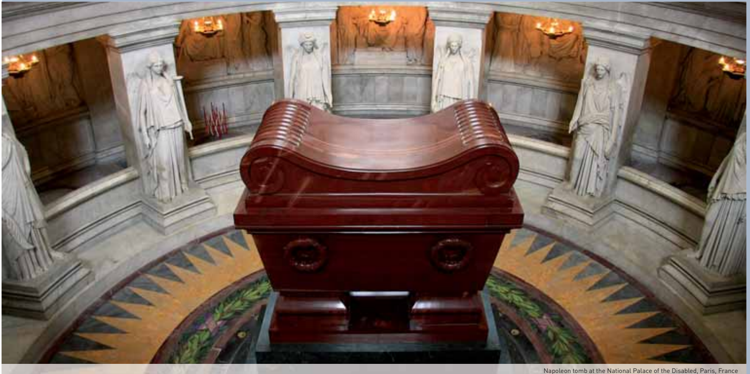
Napoleon tomb at the National Palace of the Disabled, Paris, France

Spain's history is buried in its cemeteries