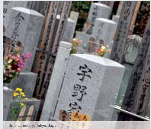
Ome cemetery, Tokyo, Japan

necessary place and a way of taking death out of the home. I am one of those people who defend these places, but everyone has to be allowed to experience death as they wish. Let there be funeral parlours for those who want them, and a wake at home for those who do not.